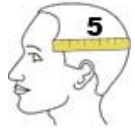
Temple to temple round back