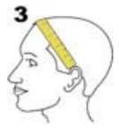
Ear to ear across forehead