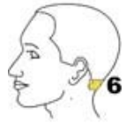
Nape of Neck

Size: 1 _____ 2 _____ 3 _____ 4 _____ 5 _____ 6 _____