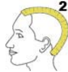
Front to Nape