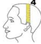
Ear to ear over top